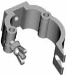
AL 8910 HALF COUPLER L = 50 mm Loading Capacity 500 kg Weight 0,36 kg