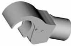
AL 8905 CLAW CLAMP Weight 0,39 kg