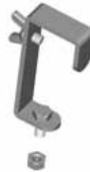
TA 8901 GALVANISED STEEL "C" HOOK Portata 40 kg Peso 0,31 kg