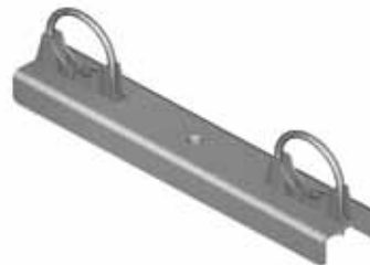
TA 8006 RIGGING ADAPTER S. 25 Loading capacity 150 kg Weight 0,80 kg