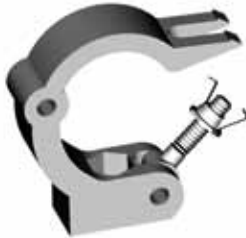
AL 8911 HALF COUPLER L = 30 mm Loading Capacity 750 kg Weight 0,36 kg