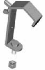
TA 8902 GALVANISED STEEL "G" HOOK WITH SPRING Portata 40 kg Peso 0,29 kg