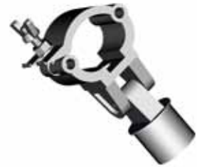
AL 8909 KNUCKLE JOINTS COUPLER Weight 0,66 kg